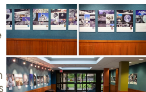
Salina Public Library NASA Exhibit