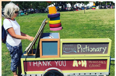
Attendee interacting with ARTery GO! at the 2019 Smoky Hill River Festival.

ARTery GO is an art cart connecting neighborhoods, artists, businesses and individuals to artist-created pop-up art experiences that are purpose-built to pique curiosity and prompt interaction. Experiences include visual art projects proposed by local artist to be challenging, creative and interactive and have been used at the Smoky Hill River Festival and other community events. Mobility and flexibility make ARTery Go the perfect partner for neighborhood and community events, street fairs, festivals, corporate functions, staff development, street corner busking, school programs and