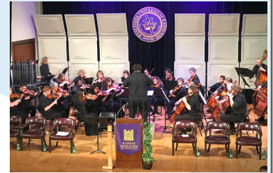
Kansas Wesleyan University String Department

to help sponsor an international String Festival. This Festival will bring the highest quality of educationally-based classical music to Salina KS. The festival will promote both city and regional collaboration by featuring KWU students, faculty, members of the Salina Symphony/ Youth Symphony, and other regional music programs. With two main event categories, education and performance, the festival will showcase two student master classes and two free concerts.