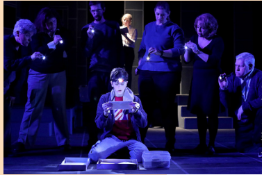
SCT production of Curious Incident of the Dog in the Night-Time

ORGANIZATIONAL PROJECT GRANTS provide dollars for innovative projects that engage patrons and audience members as active participants. Applicants are also encouraged to develop strategic partnerships within the community to strengthen the reach of their activities.