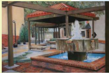
Sample Plein Air works of Downtown Salina

request to engage artists and community members in creative activities in downtown Salina. Plein Air art created during these events will be displayed in downtown businesses and organizations and at the Art Center educational wing gallery. The goals of this project include engaging community members in observing and recording the changing downtown and creating a dialogue around it.