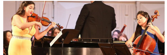
Kansas Wesleyan University International Music Festival