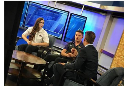
Students discuss the SHIFT festival on KAKE-TV.