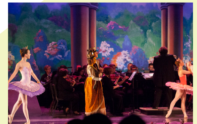
"The Nutcracker" - Symphonic Musical by Salina Symphony

Horizons has made it possible for the Symphony and our grant partners to create productions far exceeding what we could do without additional funding, including the upcoming "The Nutcracker." We have been able to reach more people with the arts because of the generosity of the Horizons donors. Additionally, this concert is a collaboration with Ballet Salina. It will also offer a unique opportunity to create public visibility of musical theatre by performing on the Stiefel Theatre stage."