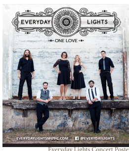
Everyday Lights Concert Poster

Everyday Lights is a group of classically trained musicians who have been collaborating since 2013. Each member is committed to the furtherance of the arts in local communities and as a group the desire to further local artistry is multiplied. Everyday Lights had free admission for their release of their third EP at Blue Heaven Studios.